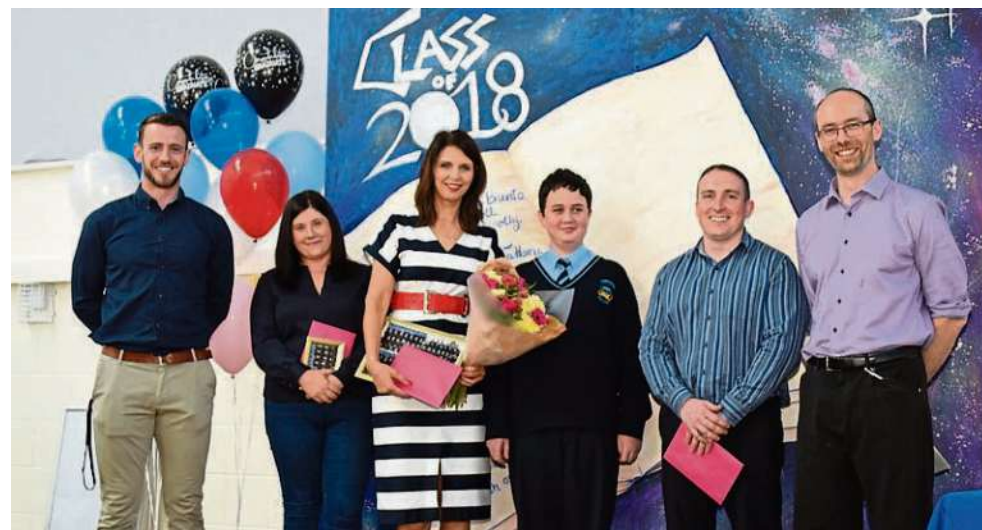
Comeragh College celebrated students achievements at a school awards ceremony recently.

The awards were presented under five categories - Cultural Award, Academic Award, Sports Award, Personal Achievement Award and Contribution to School Award and were bestowed upon students by their year heads and tutors.