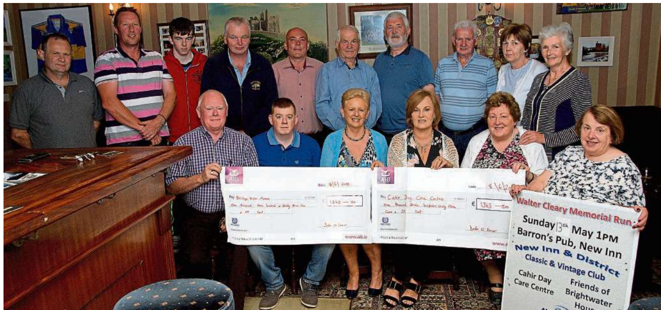
Members of New Inn Vintage and Classic Club presented the proceeds of the recent Walter Cleary Memorial Run to Cahir Day Care Centre and Bridgewater House, Clonmel. A total of € 2,727 was raised.