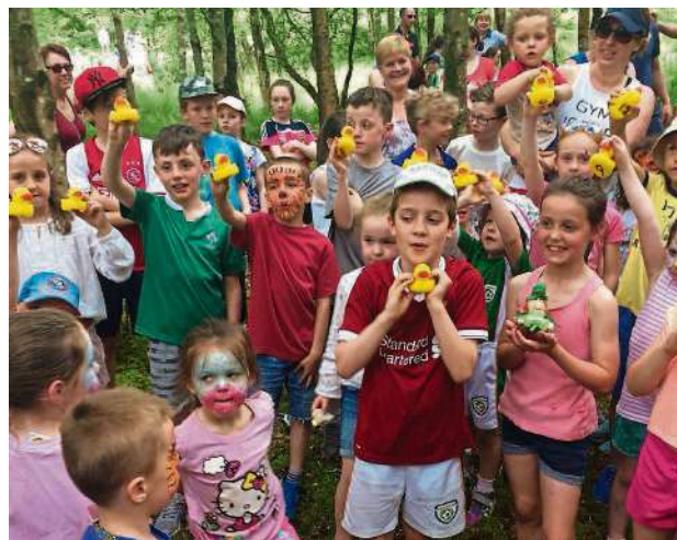
Kids at Kildanogue Duck Ponds.