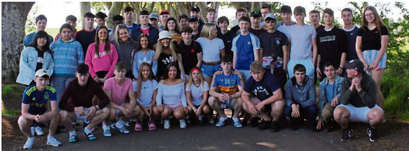
Rockwell College transition years enjoying a trip to Northern Ireland.