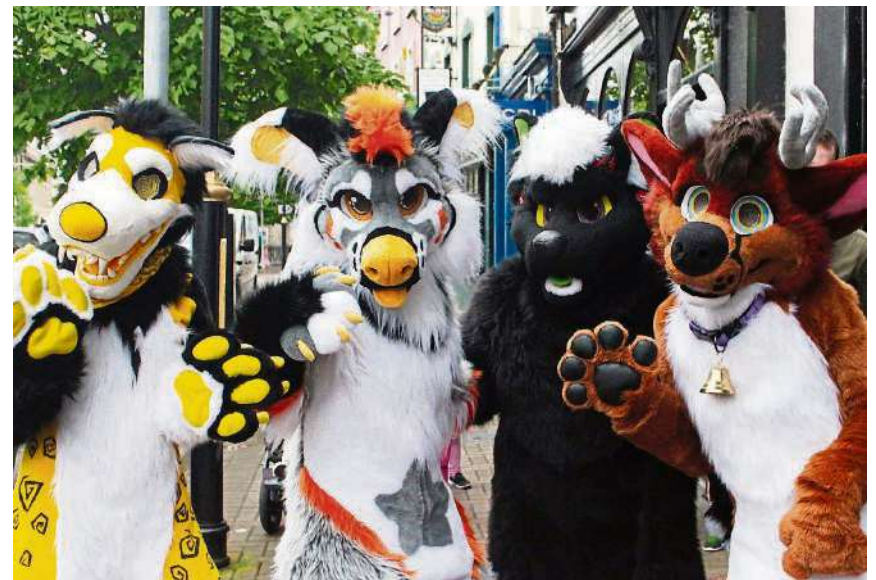
Furrries at the Clancy Brothers Festival of Music and Art in Carrick-on-Suir.